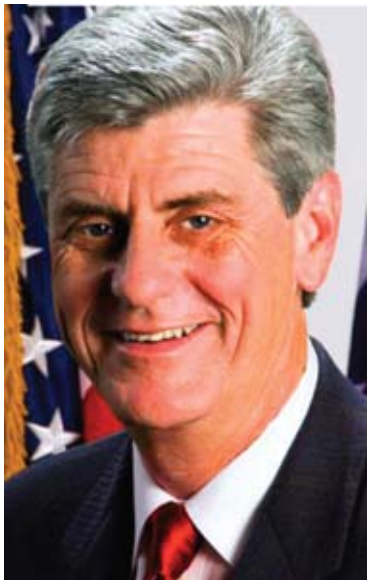
Lt. Gov Phil Bryant